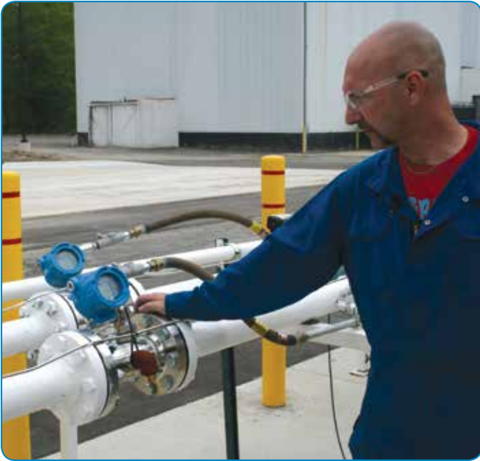
Observers were amazed when the Red Arrow Transfer Terminal's LPG-transfer system was put into operation and the flow meters reported a flow rate that exceeded 1,000 gpm.